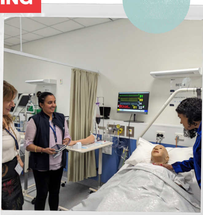
We will always continue to strengthen Medicare.

On top of our investment in bulk billing, we are investing in a $1.5 billion indexation boost across the board to Medicare rebates, increasing the amount that doctors receive for Medicare services and reducing pressure on GPs.